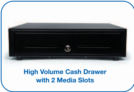
High Volume Cash Drawer with 2 Media Slots