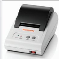
Small Footprint STP-103II 116X180X90(W X L X H mm)

The STP-103II occupies a small space effectively. It is perfectly suited for EFT POS applications and Hospitals and Medical Centers as well. It can be used for various applications and one of the most flexible thermal printer ever.